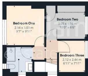
Shower Room 2.01 x 2.00 m 6'6" x 6'6"